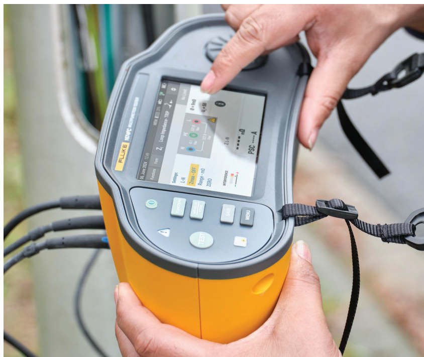
Full-color touch screen and tactile rotary knob for fast navigation

Simplify report generation with automatic report population, Fluke Connect integration, and one-touch reporting with Fluke TruTest™ software.