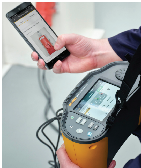
Assign photos directly to specific test points for more detailed documentation