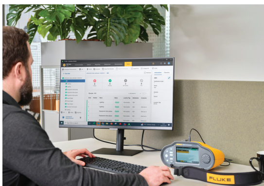
TruTest Software simplifies electrical system data management and reporting

Fluke TruTest Software allows you to create certificates that are compliant with a growing list of regional reports, including BS7671, DIN VDE 0100-600, ÖVE/ÖNORM E 8101, NIN/NIV, NEN3140, and other European installation test standards. All these reports are available at the touch of a button, and a pre-configured international template ensures that no matter your location, TruTest Software has you covered.