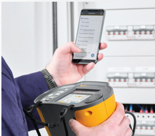
Reduce manual data entry and recordkeeping